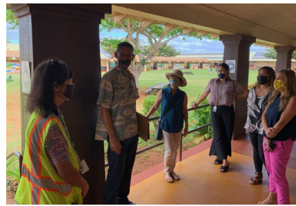
She meets with Kapaa Elementary School leadership and County to discuss safe routes to school construction plans and impacts to the school.