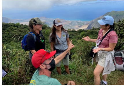
She takes a hike at Mount Ka'ala with the Department of Land and Natural Resources to learn about the Division of Forestry & Wildlife (DOFAW) efforts, fire control needs, and native ecosystem management.