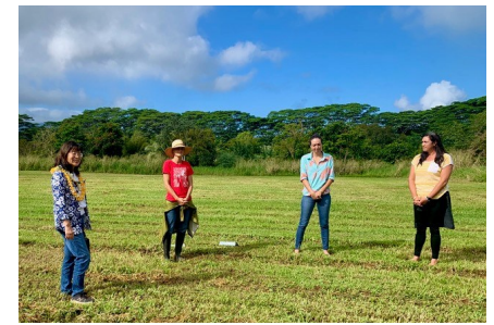
She visits the future site of the Namahana Charter School for grades 7-12, with board members and supporters.