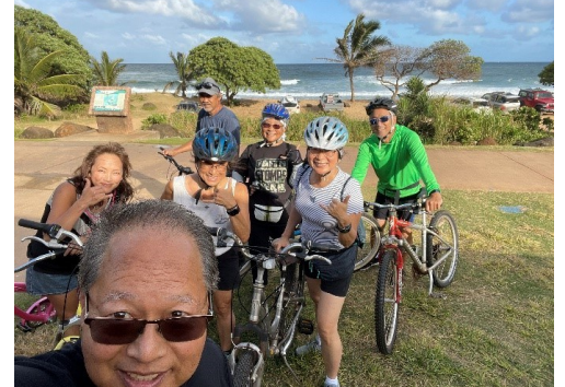
Participating in Blue Planet Foundation's Love to Ride biking competition in the month of May. Lucky to live on the east side with good friends and easy access to Ke Ala Hele Makalae , our coastal multi-use trail.