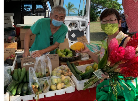
Buying local at the Kapa'a Beach Park Sunshine Market.

Establishes and appropriates funds to plan, develop, and execute a statewide film industry development strategy.