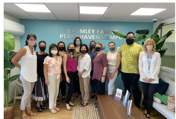
Visiting the Pearl Haven, a new special residential treatment facility for sexually exploited & trafficked youth.