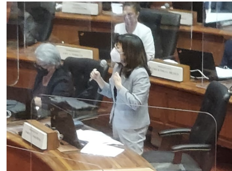
Speaking during Floor Session to support affordable housing bills.