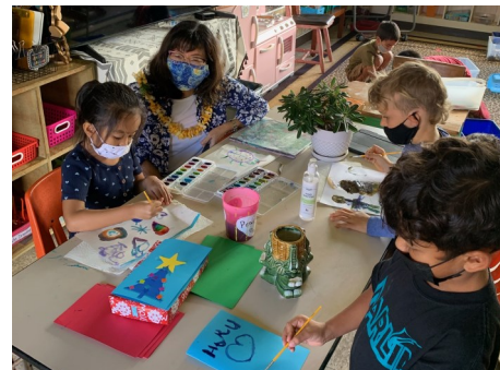
Visiting the students at Kilauea Elementary School.

Appropriates funds to the School Facilities Authority for the construction of preschool facilities for children who are three and four years old.