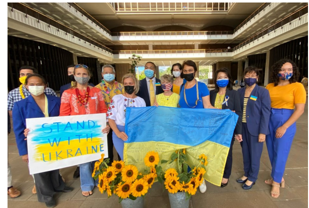
Standing with Hawaii residents from Ukraine, following the passage of a house resolution condemning Russia's unprovoked attack on Ukraine.