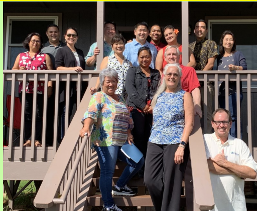
Visiting the Kaua‘i Habitat for Humanity self-help housing project in Ele‘ele with members of the House Finance Committee.

The high cost of living in Hawai‘i is one of the biggest obstacles to local families who want to build their lives and careers here. HB2541 will provide over $70 million in annual tax relief by making the Earned Income Tax Credit (EITC) refundable and permanent and increases the food/excise tax credit by 36% to $150. This legislation will save the average working class family of four approximately $500 per year in taxes.