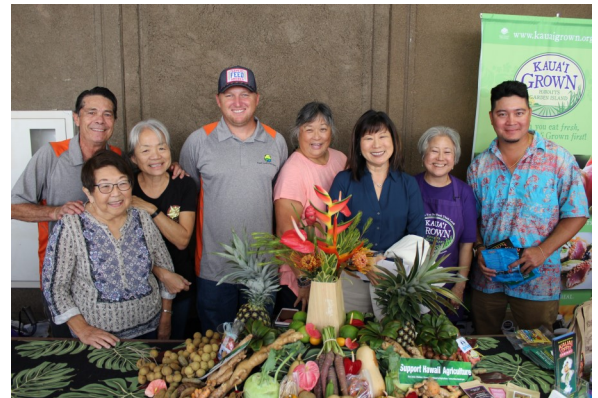
Joining the Kaua'i Farm Bureau at the Agricultural Awareness Day at the State Capitol, that showcased Kaua'i's locally-grown produce and flowers! (February 2020)