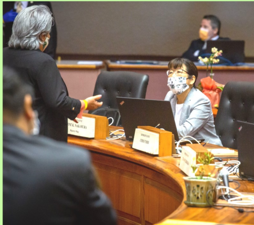
Conferring with Majority Floor Leader Dee Morikawa during the recent legislative session