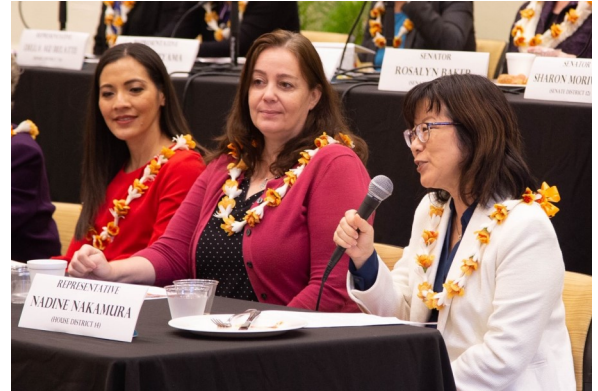
Speaking at the YWCA of Hawai'i Legislative Women's Caucus annual breakfast about upcoming legislation (January 2020).