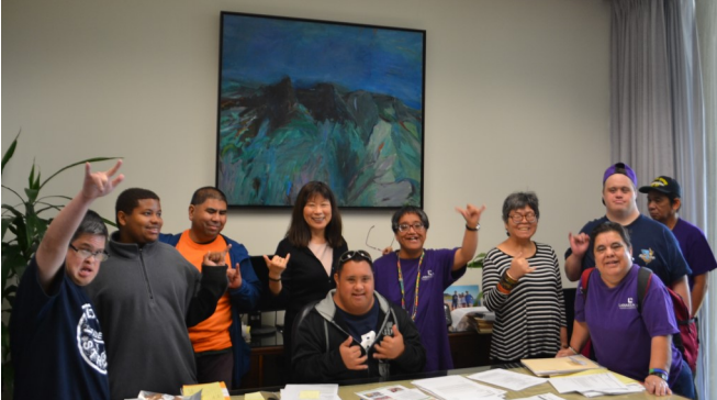
Welcoming Developmental Disability advocates at the State Capitol.