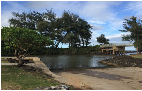
The Waikaea Canal dredging and improvements is scheduled to be completed by April 2019.