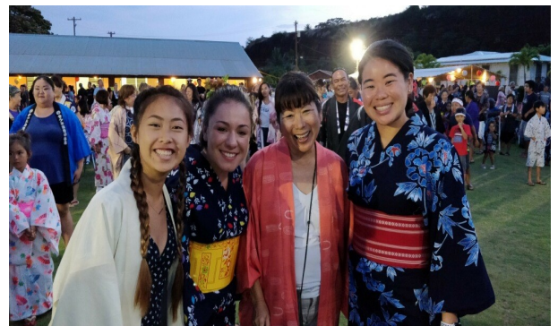
Enjoying a Kaua'i Bon dance last summer with family and friends.