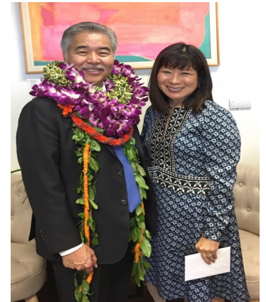
Discussing flood relief needs with Governor Ige on Opening Day at the State Capitol.