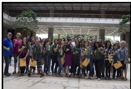
Mahalo to the dedicated AVID students and staff of Kapaa Middle School during their State Capitol visit on April 20, 2017