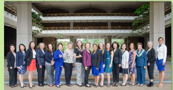
Alongside her female legislative members of the Women's Legislative Caucus